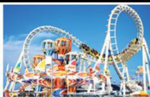
1. amusement park