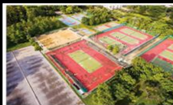
4. sports centre