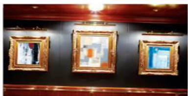
5. art gallery