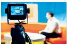
1. TV show