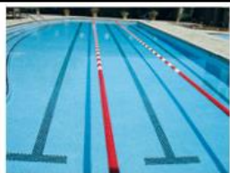
2. swimming pool