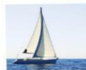
6. sailing boat